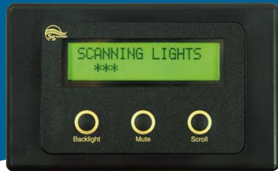
Actual Size = 120 x 80 x 19mm