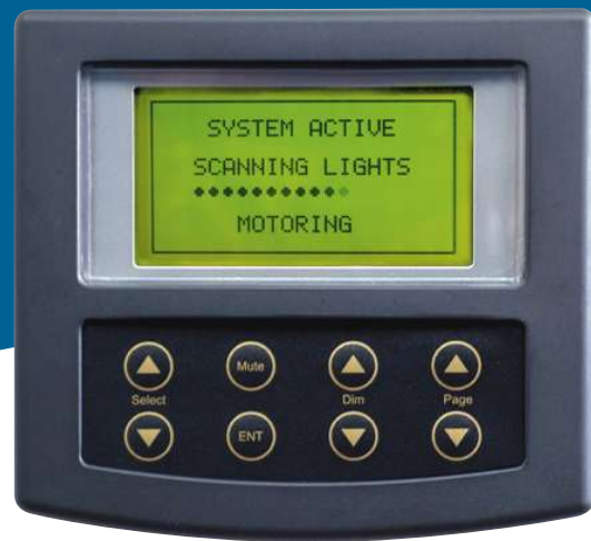
Actual Size = 126 x 116 x 21mm